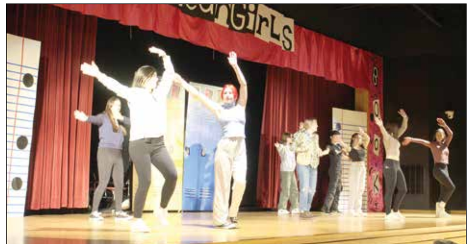
The drama club members performed an opening number as Cady Heron arrives at the school.