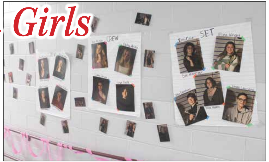
The crew and set managers were highlighted in posters on the high school's walls.