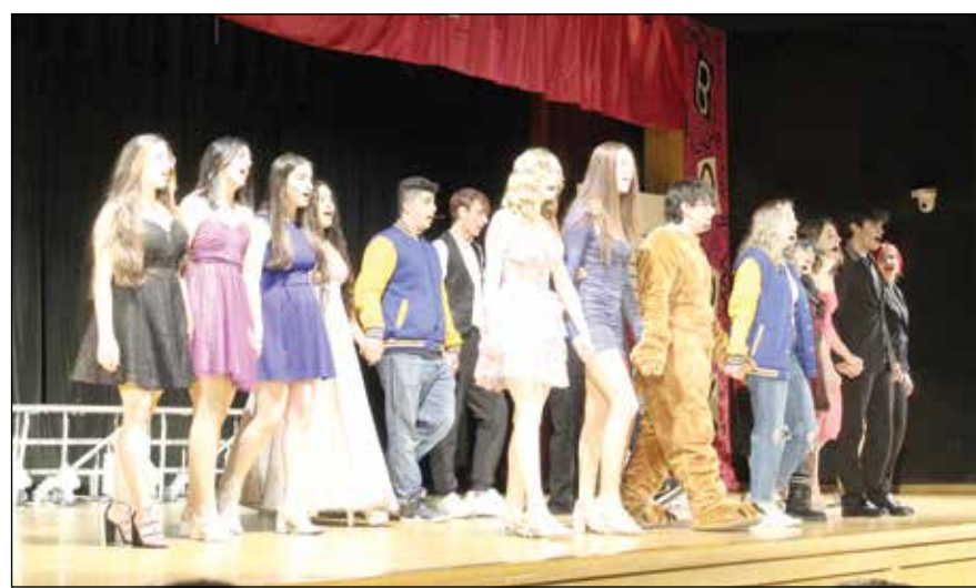
The cast comes together for the grand finale at Spring Fling.