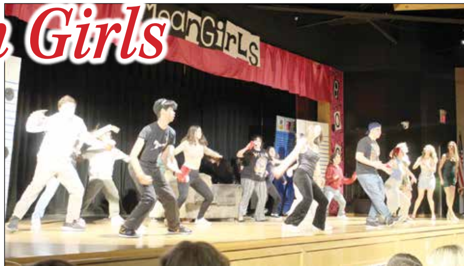
The ensemble came together for a second act dance number.