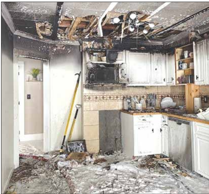
Damages to a home were the result of a kitchen fire that occurred on Monday, Feb. 3.

The fire's cause was investigated by Ludlow Fire and was determined to be unattended cooking.