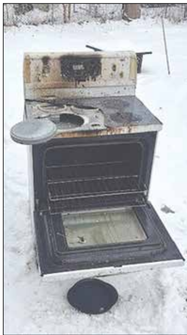
A stove was removed from a home on Lower Whitney Street as a result of a kitchen fire.