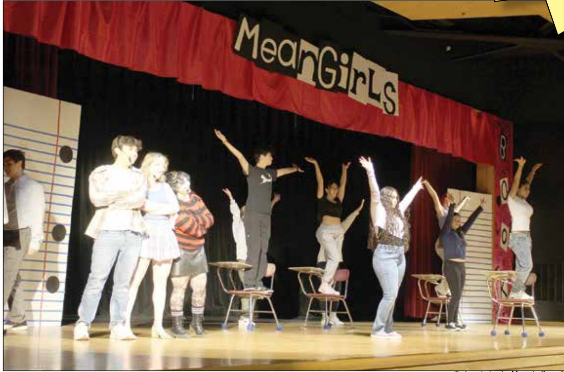
The High School Drama Club put on a production of the Mean Girls musical this weekend.