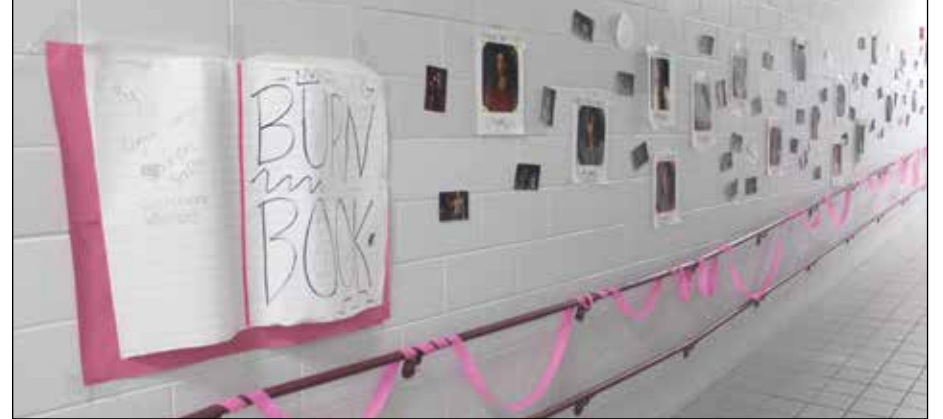
The halls of the high school were decorated with pink streamers, pictures of the cast, and a giant Burn Book.